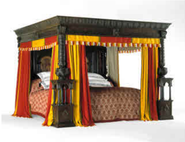
The Great Bed of Ware

From April 2012 we are pleased to announce that the Great Bed will be returning home to Ware on a one year loan from the Victoria and Albert Museum.